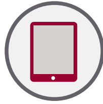
Tablets, electronic medical record equipment