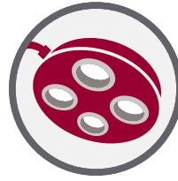
OR and procedural lights within a housing unit