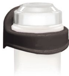
Bracket for canisters